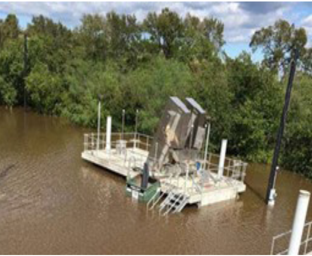
Duperon FlexRake FPFS bar screen withstands significant flooding at the City of Cuero, Texas, during Hurricane Harvey in 2017.