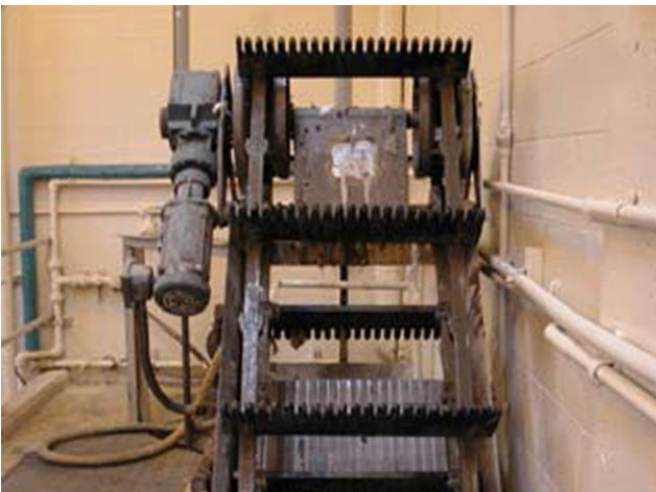
The Duperon ® FlexRake ® FP was commissioned in 1998 and has been running strong, and maintenance-free for over 20 years.