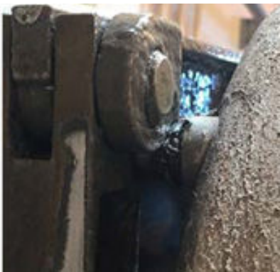
Link and pins

"... it saved tons of time and tons of maintenance costs because they are pretty much maintenance-free."